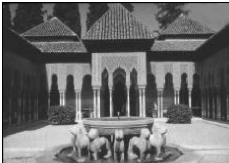
Court of the Lions at the Alhambra Palace

With the fall of each Muslim city, European scholars flocked to the newly discovered libraries and poured over texts on Islamic law, faith, science and technology. Manuscripts by such Spanish-Muslim luminaries as Al-Zahrawi, Ibn Haitham, Ibn Zuhr, al-Idrisi, and Ibn Khaldun made their way to European universities after being translated into Latin by Christian scholars. Of course, the most famous of all the Spanish Muslim scholars was Ibn Rushd, (Averroes in Latin) a philosopher, judge